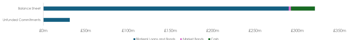
Assets and Commitments

LTV information is based on the current LTV (calculated in accordance with note 12) rather than the previously presented LTV at the point of investment.