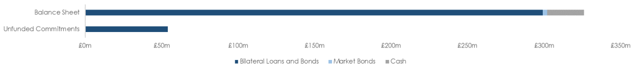
Assets and Commitments